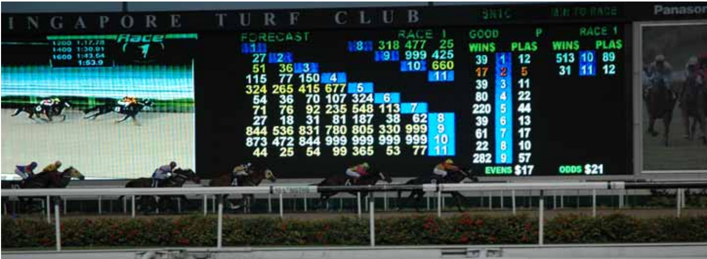
Horse racing at Singapore Turf Club with lucky draws