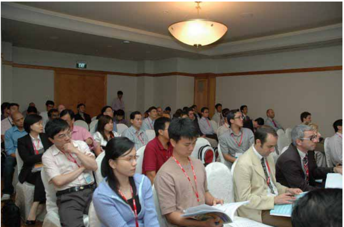
Oral presentations in 6 parallel technical sessions