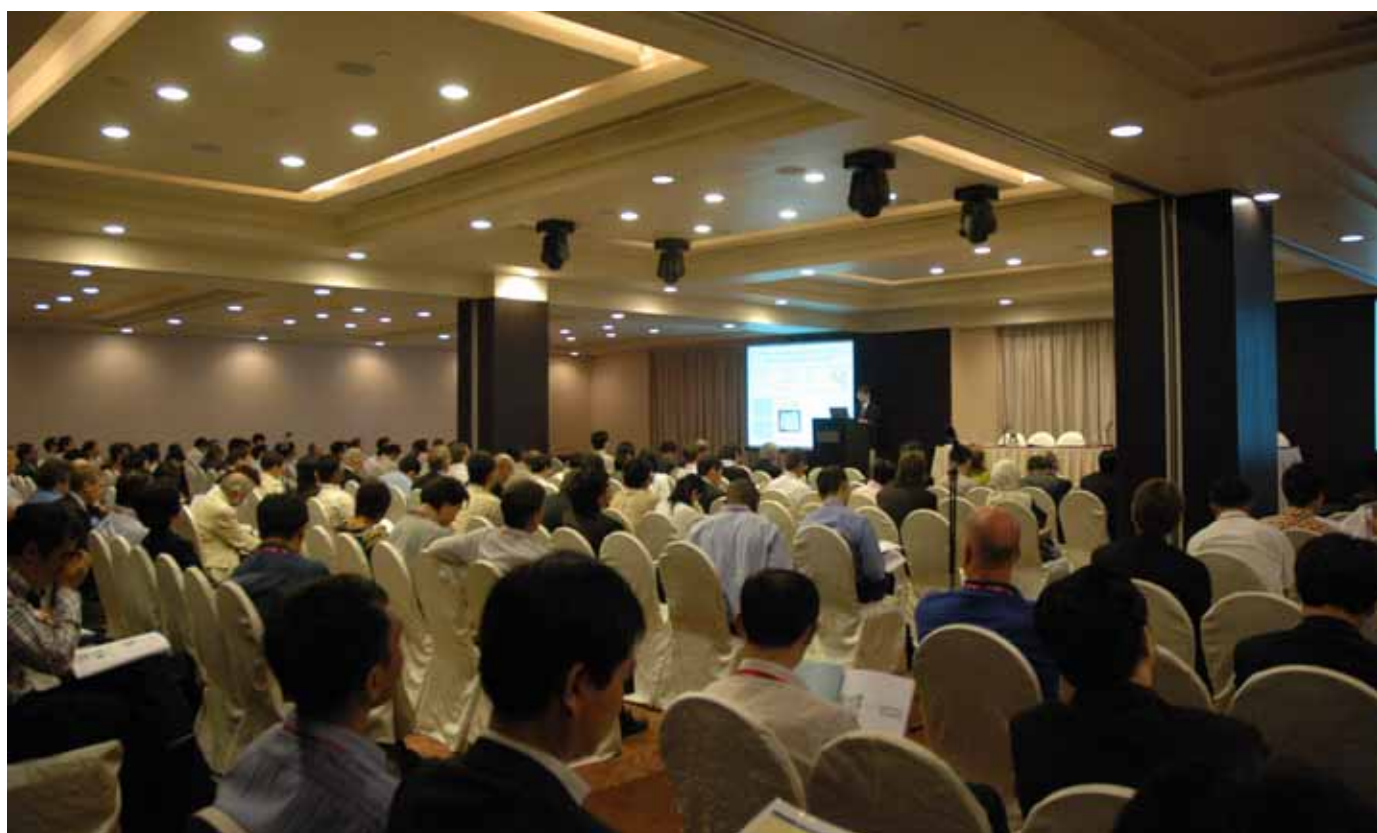
Audience attending plenary session