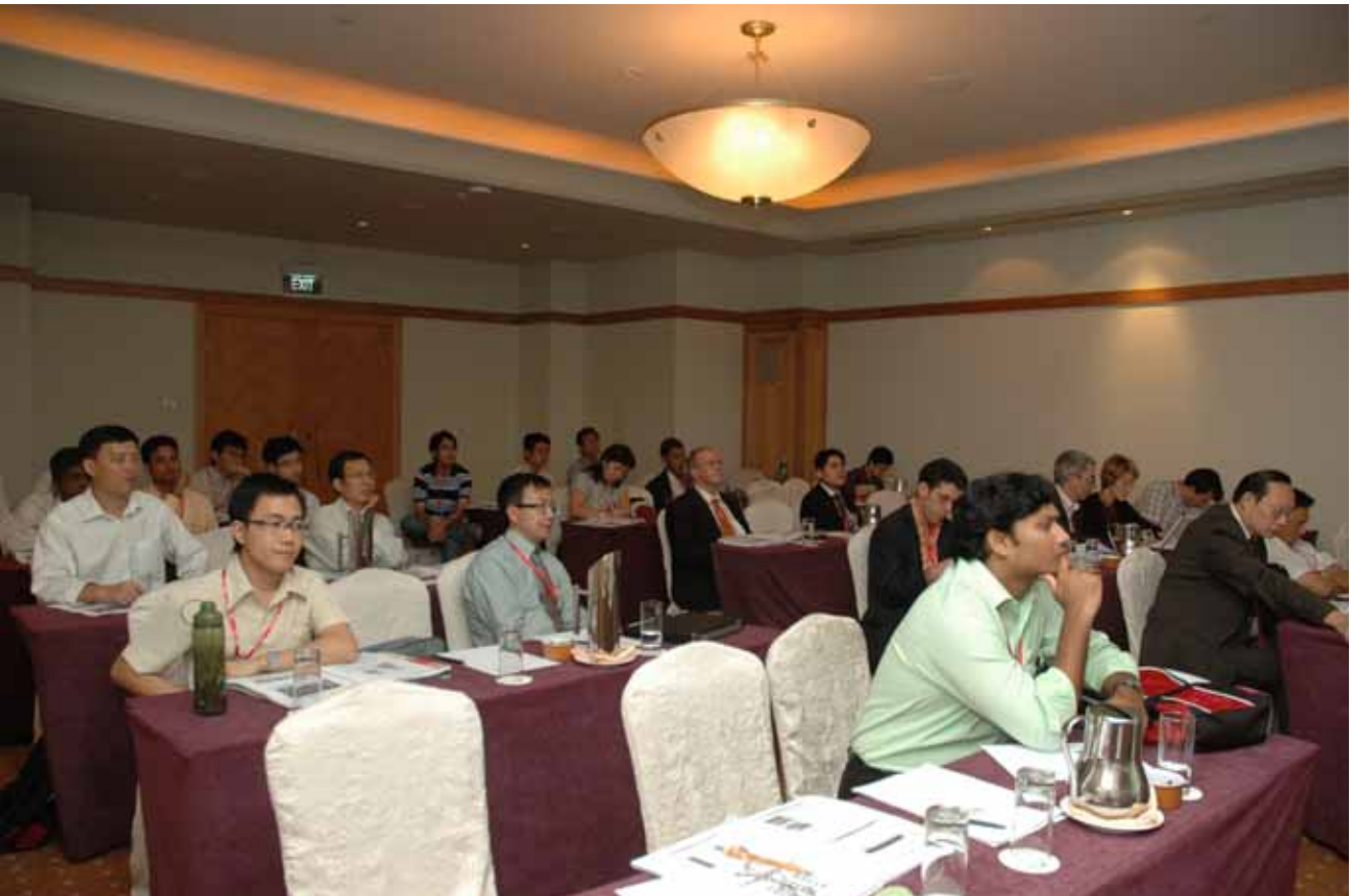
Over 100 attendees in 4 parallel AM/PM short courses