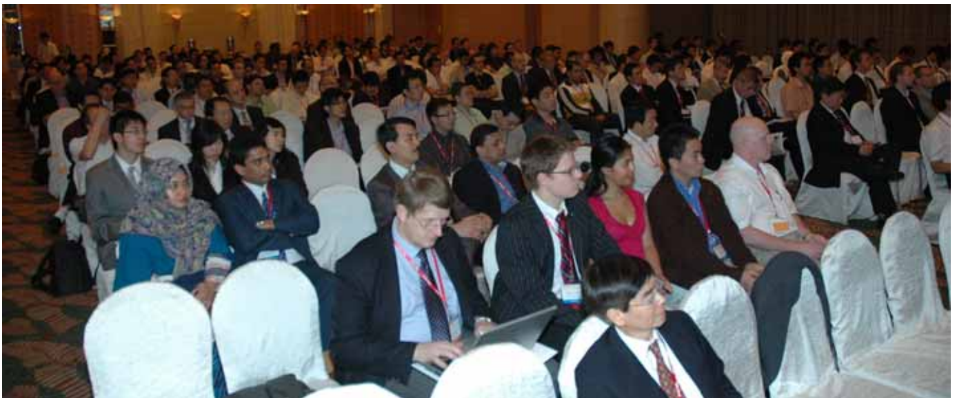
Over 400 delegates attending EPTC08 conference