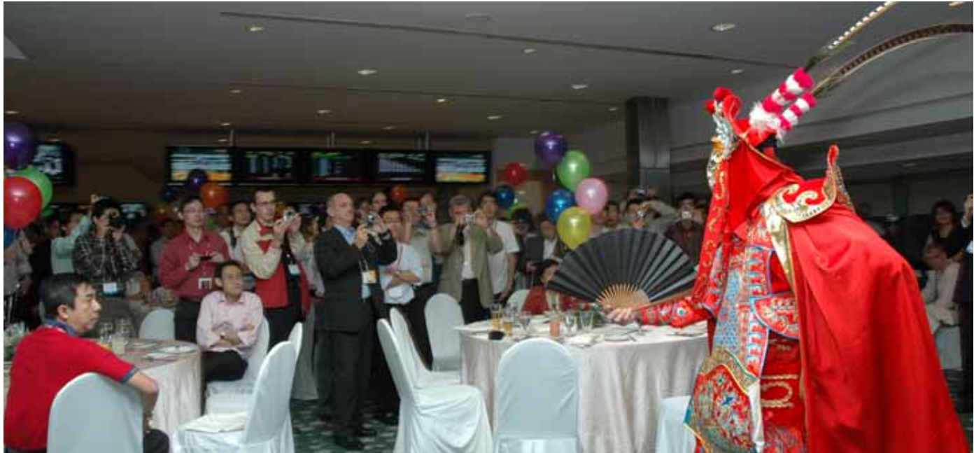
Face-change performance during banquet