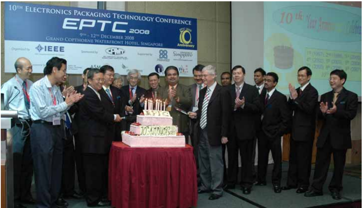
Cake-cutting for 10 th Anniversary Celebration of EPTC