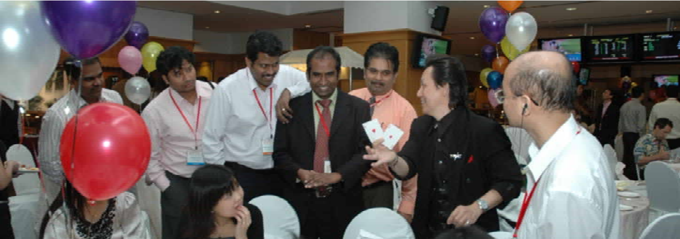
Magician show with various tricks