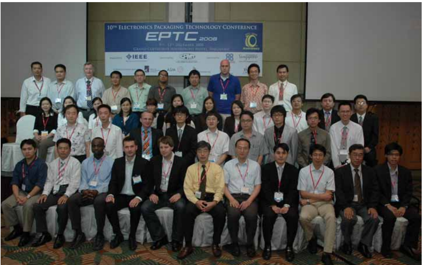
Group photo of some delegates after luncheon